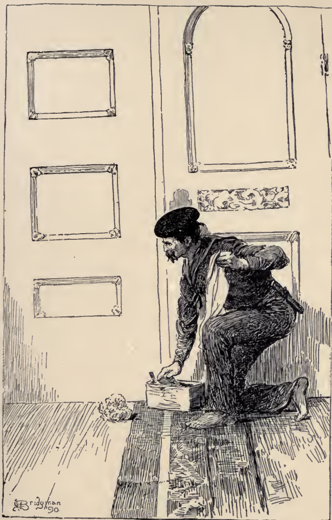
MULGRUM AT THE CAPTAIN'S DOOR.